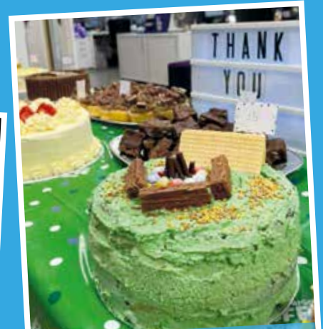
Macmillan Coffee Morning