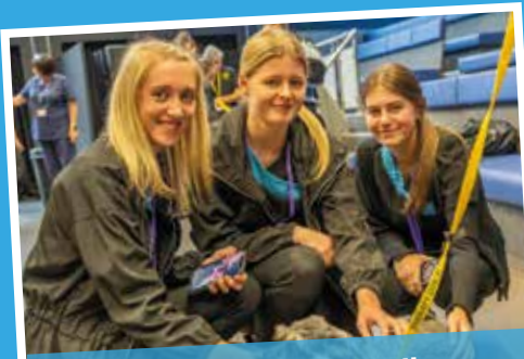
Therapy dogs visit college

Caring students and staff have taken part in a range of activities during this term to fundraise, support and remember.