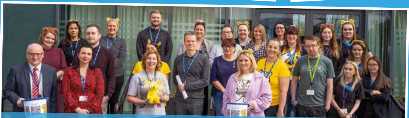
Staff and students raise money for Children in Need