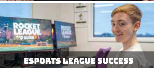
ESPORTS LEAGUE SUCCESS

RIVERSIDE COLLEGE: IN THE TOP 10 ORGANISATIONS FOR MEDAL POINTS