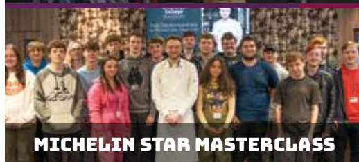
MICHELIN STAR MASTERCLASS