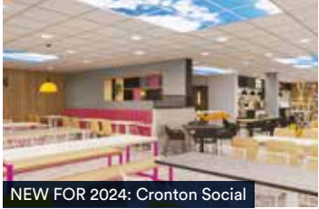
NEW FOR 2024: Cronton Social

Scan the QR code to watch our latest facilities video