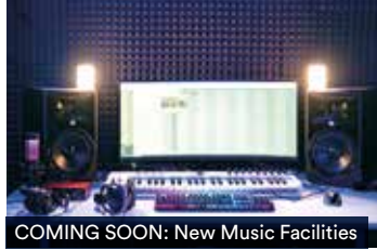
COMING SOON: New Music Facilities