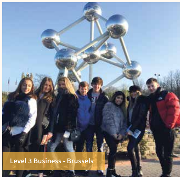
Level 3 Business - Brussels

Economics is a fascinating and increasingly popular subject which examines society's resources and how they are allocated. You will study some of the fundamental forces which affect our everyday lives such as employment, wages, the price of goods and services and government policy in terms of taxation and spending. From a government's perspective, 'why does government tax certain goods more than others?' and 'how are we affected by what happens in another country's economy?' You will have opportunities to put your learning into action by entering essay competitions such as 'Make your Mark' advising the Chancellor on economic policy and also through competitions run by the Bank of England.